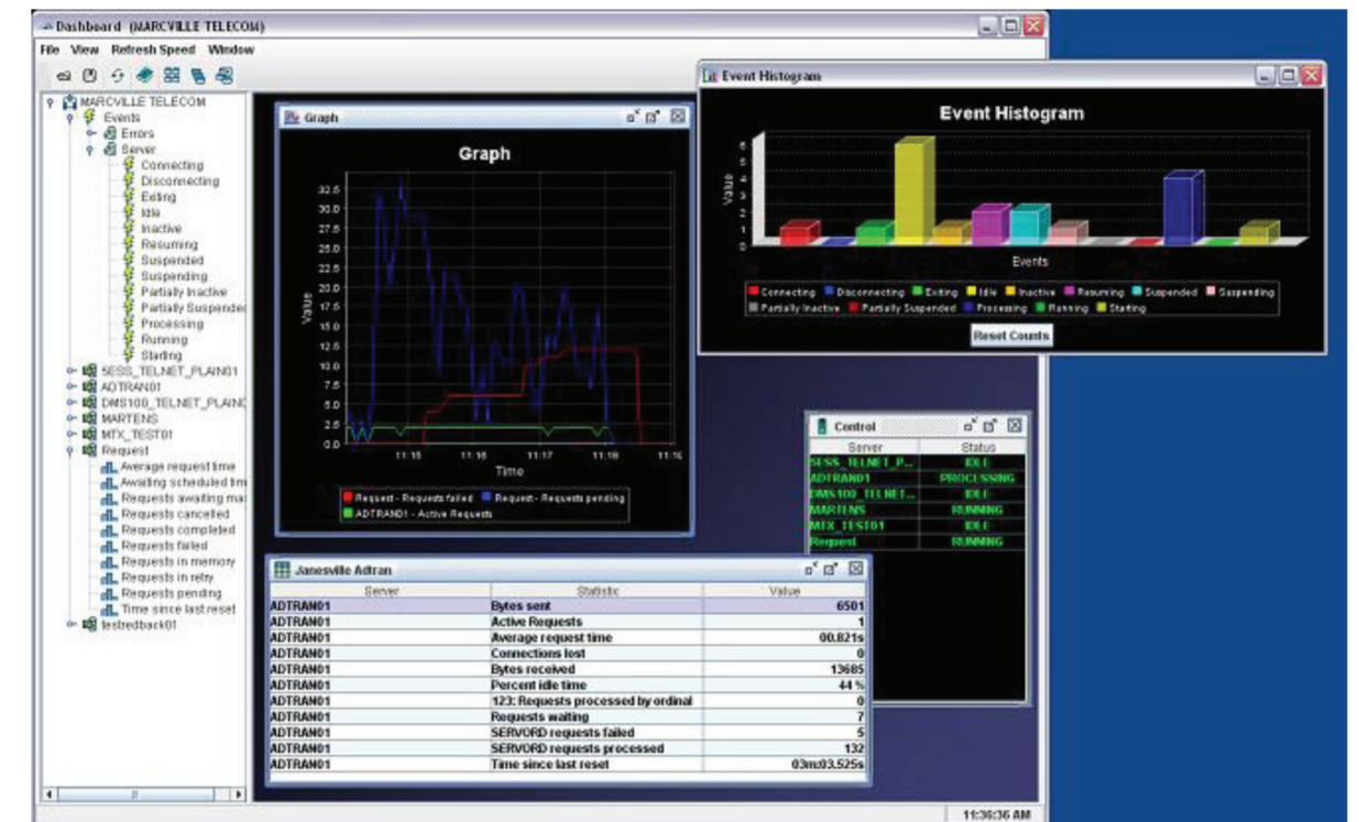
In easy-to-understand visual formats, the OSG solution provides a real-time dashboard of system performance and provisioning status of network devices and application servers.

Regardless of the client service, SaskTel OSG eliminates provisioning limitations by delivering the technological capability to interact with any programmable network device.